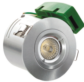
90mm fixed satin chrome downlight kit