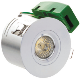
90mm fixed white downlight kit